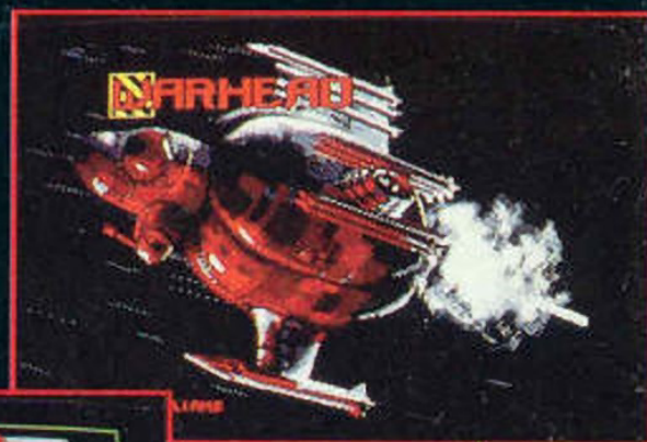
Atari ST screens shown.

MARKETED AND DISTRIBUTED BY ACTIVISION (UK) LTD